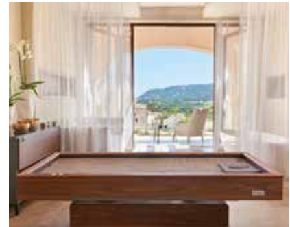
Park Hyatt Mallorca, Spain