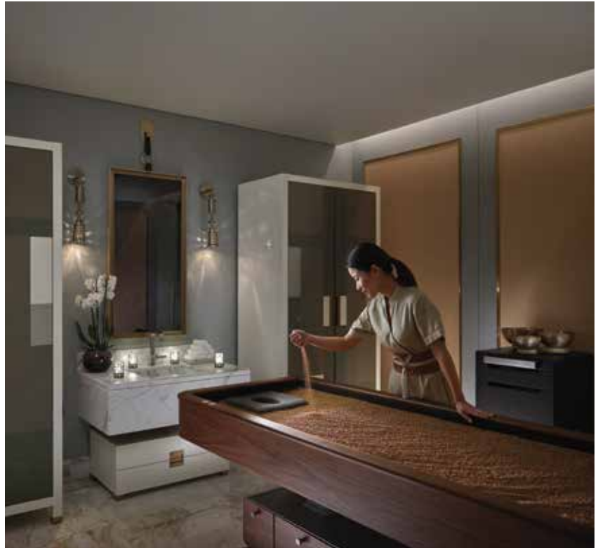
Mandarin Oriental Doha, Qatar