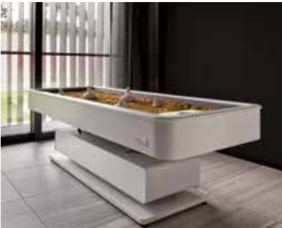
La Butte aux Bois, Belgium