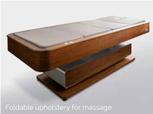
Foldable upholstery for massage