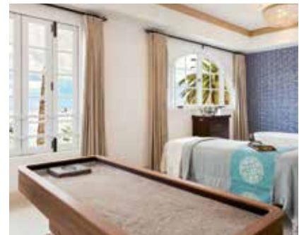
Island Spa Catalina, USA