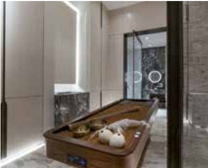
FIVE Palm Jumeirah, Dubai