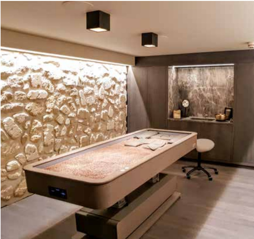
The Lamp Hotel, Sweden

EXPERIENCE THE PSAMMO CONCEPT HERE & IN MANY MORE PLACES.