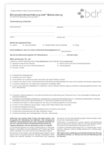
Consent form block Art. 180303 Content: Block A4, 50 sets