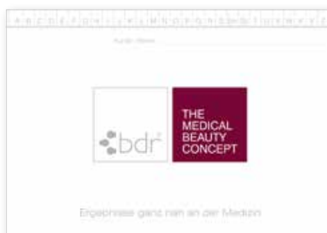
Anamnesis card Art. 180300 Contents: 10 pcs, customer file A5