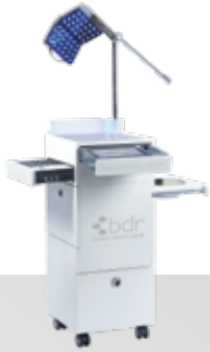
bdr® EXPERT inclusive Calming Light Light Concept