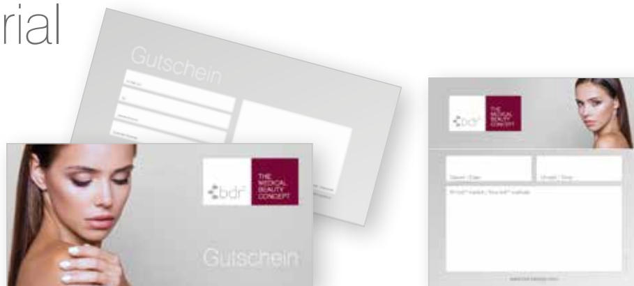
Voucher Art. 180321 Content: 10 pcs incl. envelope